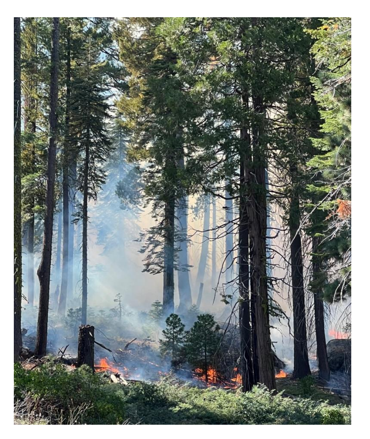
Page 2, Quarry Fire, 9/24/2023

Today, crews ignited unburned pockets, filling in areas where fire hasn't burned within the perimeter, leaving behind a desired mosaic effect.